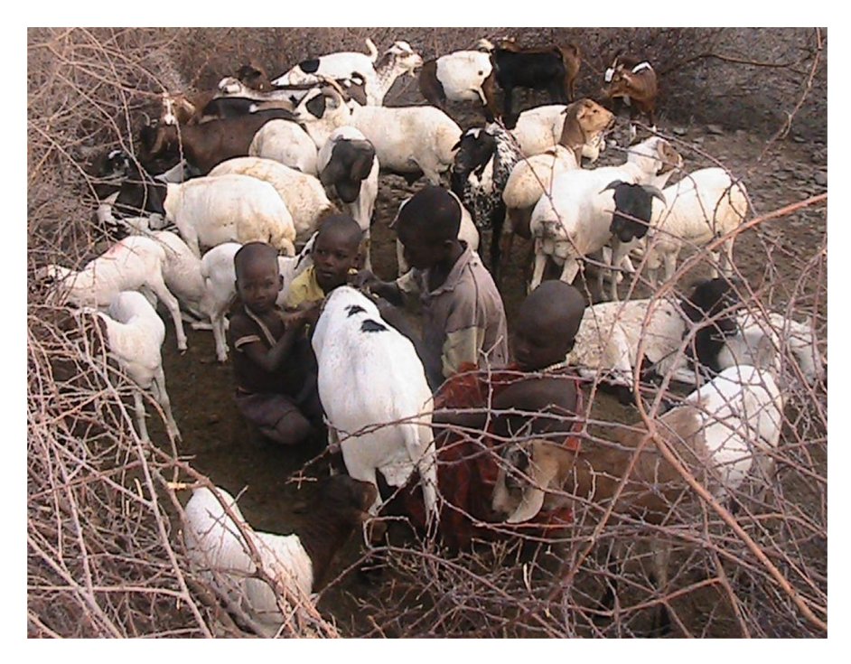
Fig. 4 This is the family context of a pastoralist environment, where children's everyday life activities are based on livestock herding

foundation of learning in both academic subjects and in the acquisition of a second language. African researchers argue that the mother tongues in Africa need to be revitalised and used in all spheres of life, because they are