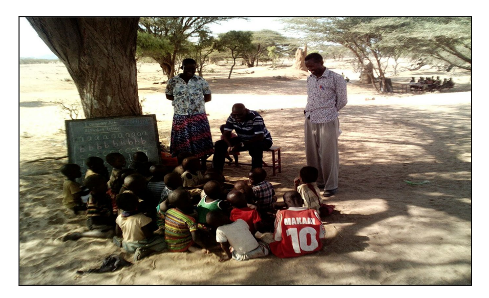
Fig. 2 Sharing mother-tongue stories with children in a Turkana ECDC "classroom". Note: I asked for this photo to be taken with permission of the two teachers and the children during my research work with the African Storybook project (ASP). The female teacher is the preschool teacher; the male teacher standing is the Head teacher; I am seated on the bench